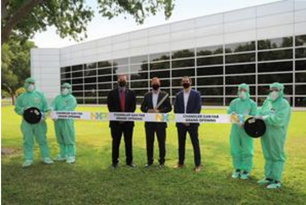
High-volume manufacturing facility is the most advanced GaN fab for RF in the United States